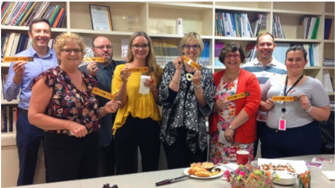
Harmony Day at FECCA.

We continue to plan for our conference in Darwin later in the year and our conference website will be launched later this month. It is shaping up to be an exciting event and we hope to see you all there.