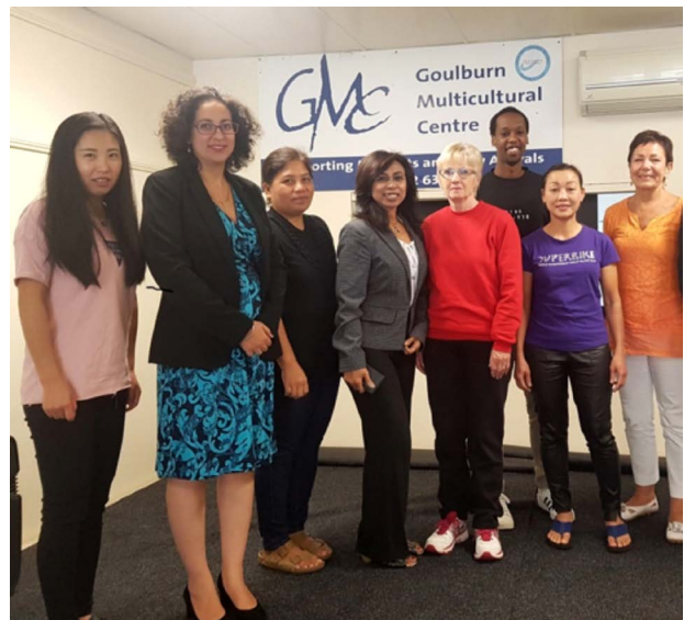
Members of FECCA meet with members of the Goulburn Multicultural Centre for a Community Consultation

FECCA gained wide coverage of its campaign. From its media release , noting its disappointment that the Government chose Harmony Day and International Day for the Elimination of Racial Discrimination to our opening statement to the committee, FECCA has frequently appeared in the national media including the Guardian , ABC , and the Conversation .